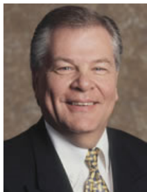
Mayor Patrick Dunlavy

In an effort to address issues such as energy use and costs in Tooele City government, I have initiated a program that will help us to more efficiently manage these costs. This plan will identify, implement and help us realize savings in areas such as power reduction, energy reduction, building heating and cooling costs, and lighting. It will also